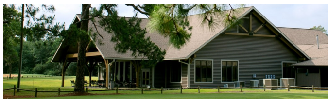
FAIRWAY GRILL RESTIURANT